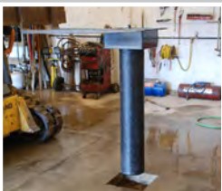
Place cylinder in hole.