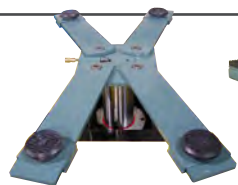
Various Lifting Platforms and Superstructures Available!