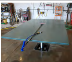
Install Lifting Structure and take full advantage of your cool time-saving tool.

~ DOES NOT REQUIRE ELECTRICITY OR HYDRAULIC PUMP ~