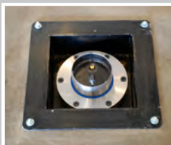
Drill holes, anchor down, and add fluid.