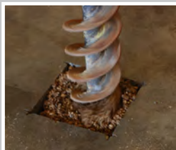
Simply saw through concrete. Auger hole for cylinder.

outperform competitors and your expectations. own the coolest piece of equipment in your shop.