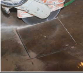
Simply saw through concrete.