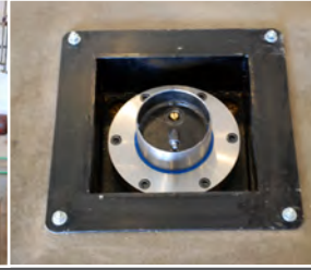
Drill holes, anchor down, and add fluid.