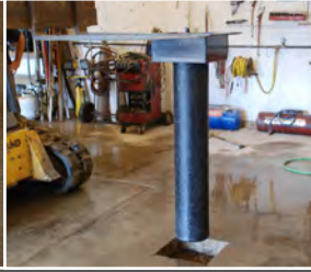
Place cylinder in hole.