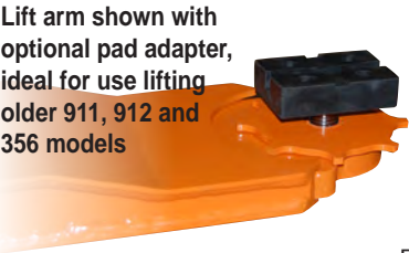
Lift arm shown with optional pad adapter, ideal for use lifting older 911, 912 and 356 models

Dial-A-Dapter An SVI Industry First! The fine adjustment wheel allows the user to fully and properly engage the vehicle lifting points before the lifting even begins. Spotting is a thing of the past and so is the guesswork. This is another SVI industry first and SVI commitment to safety detail.