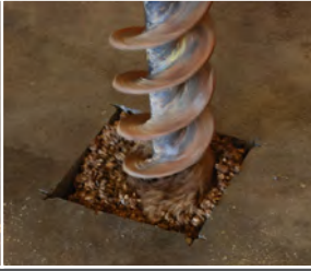
Auger hole for cylinder.