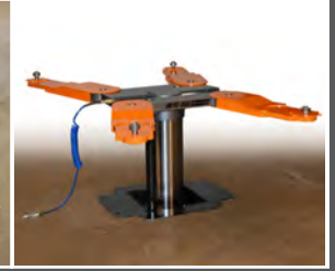
Install Lifting Structure and take full advantage of your cool time-saving tool.