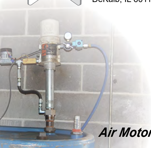
Air Motor Rebuild Kits