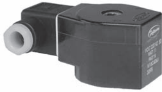
DIN 43650 Shape A