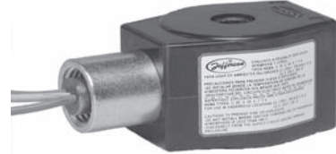
NEMA 4x IEC 79-18m