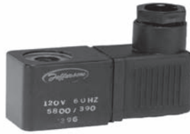
DIN 43650 Shape B