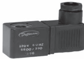
DIN 43650 Shape B