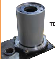
TDC Chrome-Plated Plungers