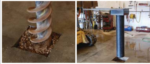
Simply saw through concrete. Auger hole for cylinder.