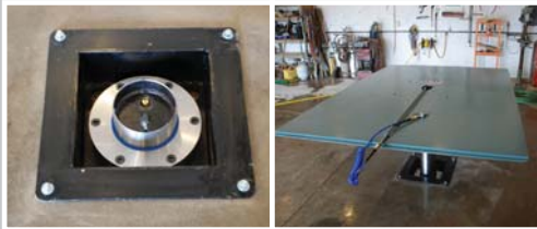
Drill holes, anchor down, and add fluid.