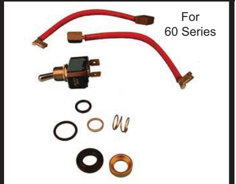
BP-4211-36 Brush/Switch Replacement Kit