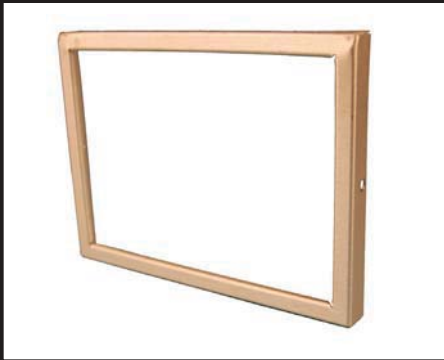
BP-4212-04 Meter Bezel - 4860