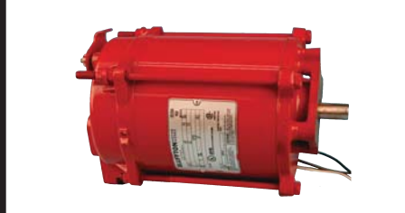
1/3 HP Motor 60Hz. 48 Frame