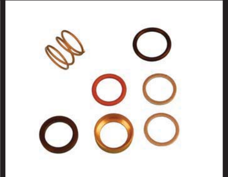
BP-4210-04 Seal Kit - 600 Series