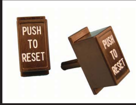
BP-4212-18 Reset Button