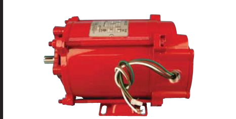
1/3 HP Motor 60Hz. 48 Frame