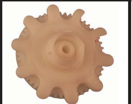
BP-4212-20 Center Wheel for 1860 Register