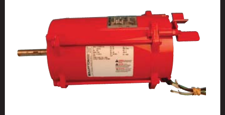
BP-4218-25 Motor for Models 25 & 250 BP-4218-26 Motor for Models 26, 27, 28