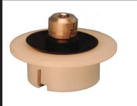
BP-4211-08 Check Valve - 60 Series