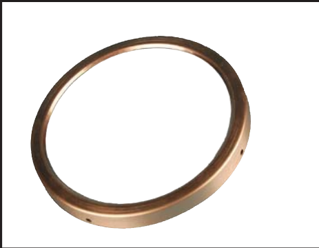
BP-4212-40 Meter Bezel - Round (70 Series)