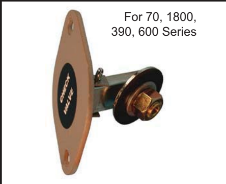
BP-4210-28 Check Valve Assy.