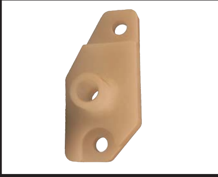
BP-4212-17 Reset Bearing