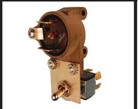
BP-4218-07A Switch & Protector 4 Terminal