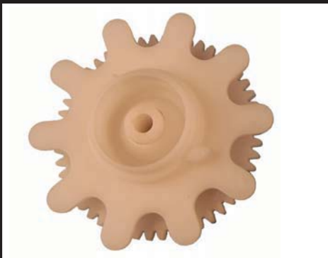
BP-4212-21 Left Wheel for 1860 Register