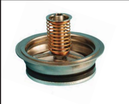
BP-4210-67 Check Valve Assembly