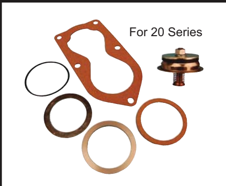
BP-4210-60 Check Valve Retrofit Kits