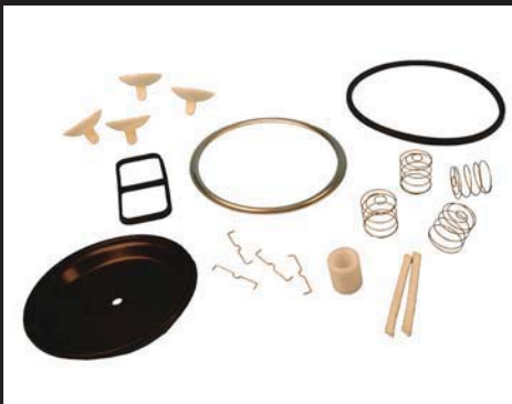
BP-4217-05 Repair Kit for 1720A, 1520 & 787