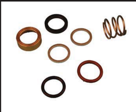
BP-4210-23 Seal Kit for 70 Series & 1820