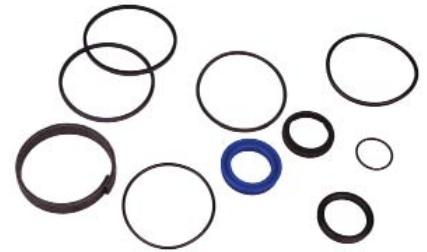
BH-7230-31A For Holmac