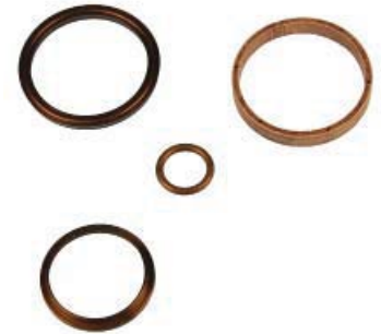
BH-7226-10 For Bruning