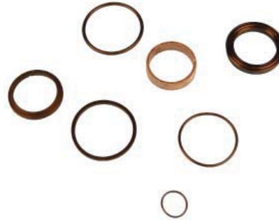
BH-7225-60 For Arlington