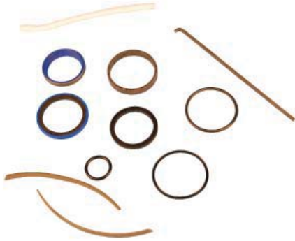
BH-7225-06 For Massey-Ferguson / Pacoma

(Also see Hydraulic Cylinder Reference on previous page)