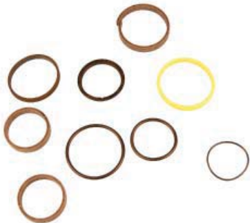
BH-7225-59 For Holmac