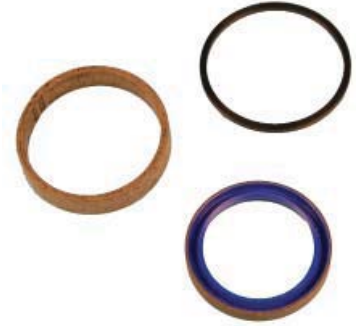
BH-7225-58 For Seitz