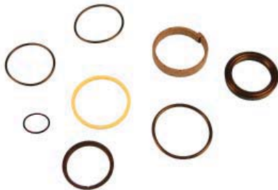
BH-7226-60 For Lantex