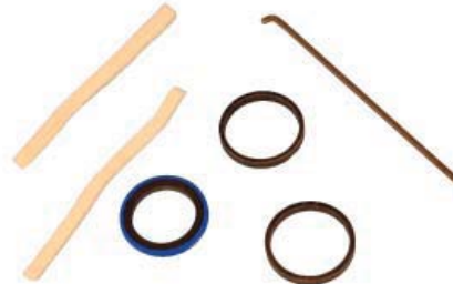
BH-7226-62 For Pacoma