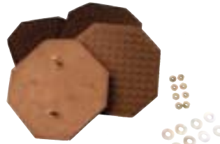
BH-7225-01-4 (Kit for 1 Lift)