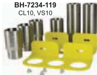
BH-7234-119 CL10, VS10