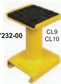
BH-7232-00 CL9 CL10