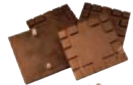
BH-7232-01-4 (Kit for 1 Lift) (CL9, Early CL10, Early VS10, E10)

SVI Exclusive: Heavy duty adapter base with increased plate thickness and additional welding process. (CL9, CL10)