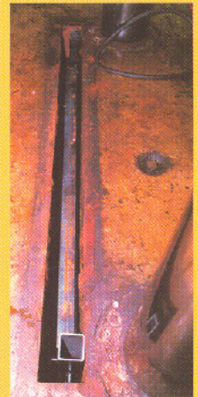
Sealed guide tube system shown lowered in place.

DTO28 lifts were produced by Rotary lift and can be readily found in the following locations: Muffler Shops, Tire Dealerships and Car Dealerships.