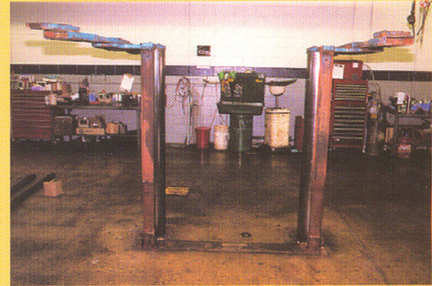
This DTO28 was raised nightly for floor cleaning. One day it just simply would not go back down.

SVI's Drop-In Rack and Pinion Equalizer Upgrade Kit is the solution DTO28 lift owners have been seeking.